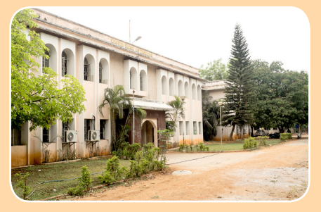
Dept. of Computer Science & Engineering