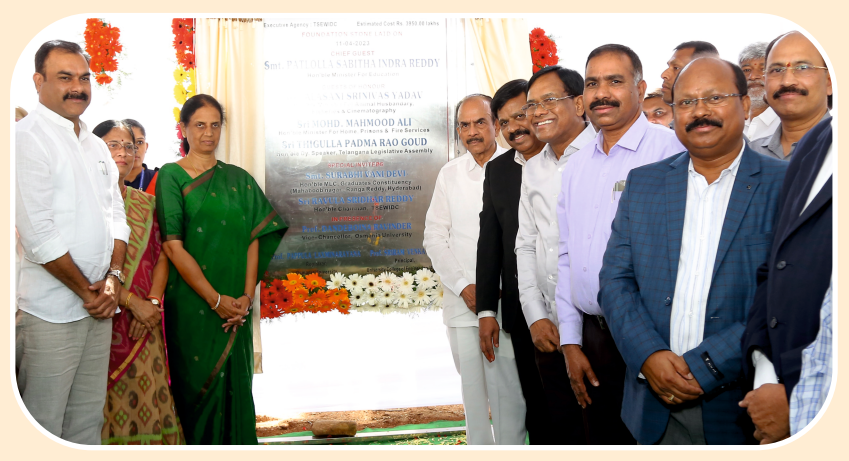
Foundation Stone for Engineering Hostel for Boys