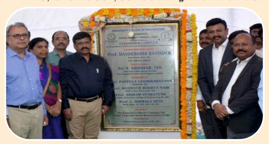
Foundation Stone for Class Room Complex in ECE Department