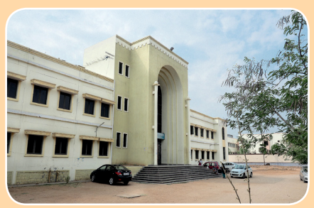
Science & Humanities Block