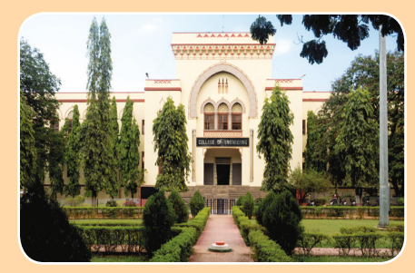
Dept. of Civil Engineering